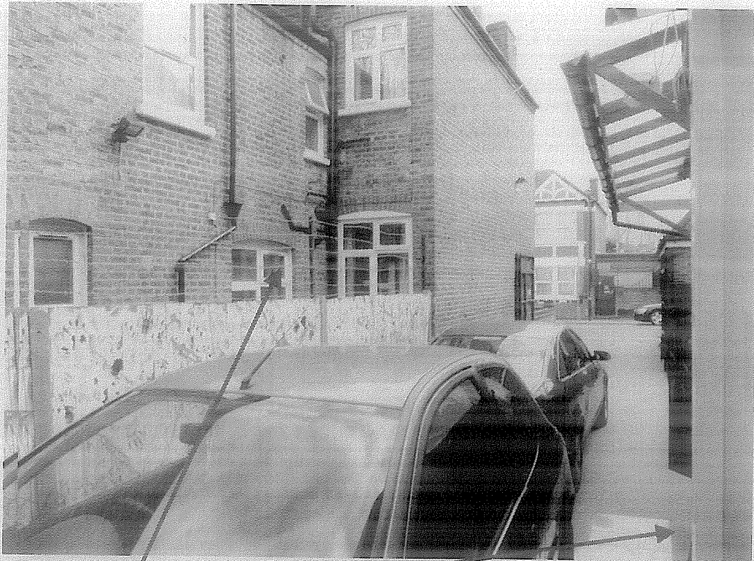
Above: 1 Stanhope Gardens from the door of proposed café Below: the proposed café with Licensing notice in window, next door: Mezzo smoking area